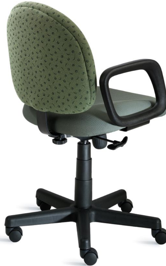
chairs pictured from left to right: 1725-GT-A1, 1725-R1-A4, 1726-B2-00, 1728-S2-A1