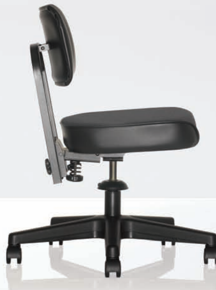
S22 Shown in Combination Spectrum and Patriot Vinyl

United Chair® products comply with ANSI/BIFMA X5.1-2002 and ISO 14001:1996 standards. Information contained herein is subject to change without notice.