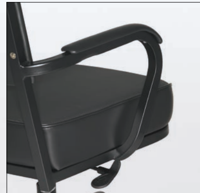
Plastic arm option