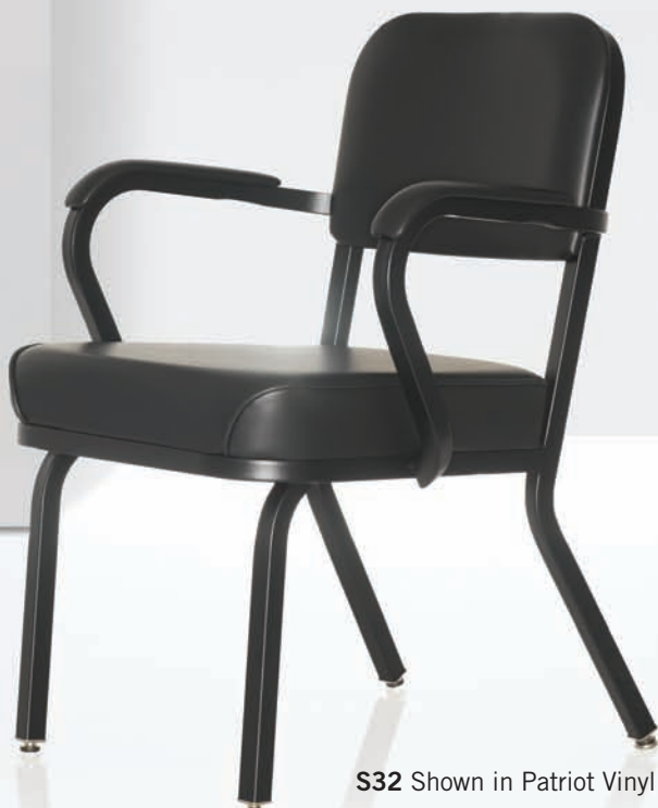
S32 Shown in Patriot Vinyl