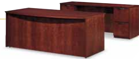
Merion Desk and Credenza Overall Dimensions 6' x 9'