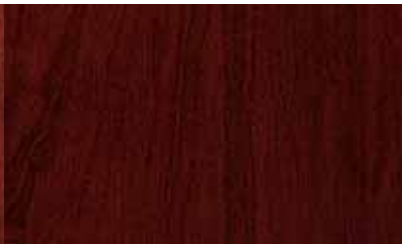
Cordovan Cherry (veneer)