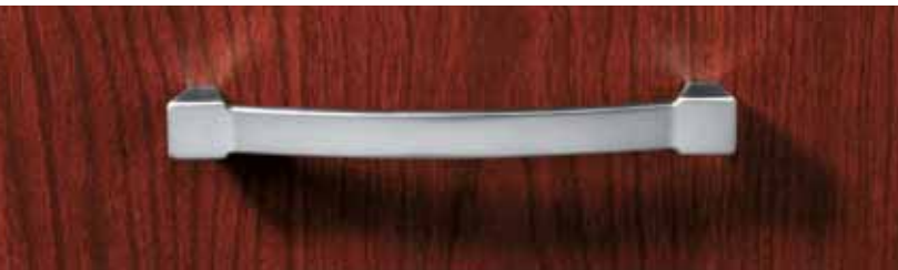
Matte Chrome Pull 52