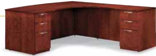
Merion L-Unit Overall Dimensions 6' x 7'