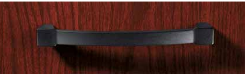
Matte Black Pull 62