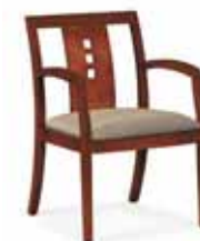
Cashmere Executive Tilt Swivel with Loop Arms, W5020 with Davenport K93066 "Black" leather, Card 25-05 Fiesta Guest Chairs, W312 with 6041 "Grid" upholstery, Card 24-03