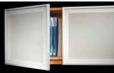
Frosted Glass Doors with Aluma Frames