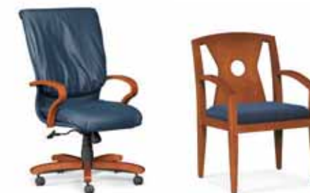
Escada Executive Tilt Swivel, W245 with Davenport K93058 "Atlantis" leather, Card 25-05 Ithaca Guest Chairs, W284 with B12059 Basis "Indigo" upholstery, Card 26-02

If you've been looking and don't see an arrangement that's just right, try working with Merion as individual elements. This way, you and your Whiteball sales representative can create the workstation you envision. Best of all, there's no extra cost and no extra waiting.