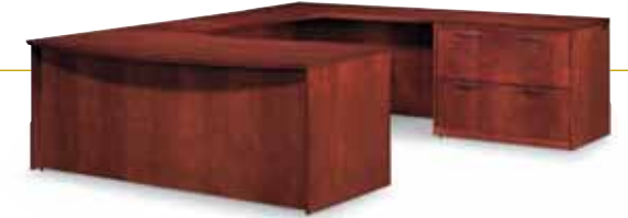
Merion U-Unit with 90" Credenza Overall Dimensions 7.5' x 9'