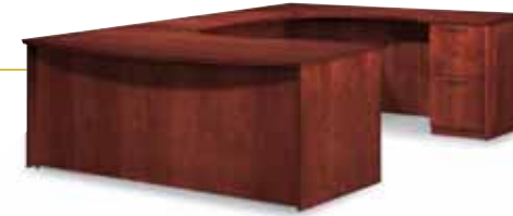
Merion U-Unit with 72" Credenza Overall Dimensions 6' x 9'