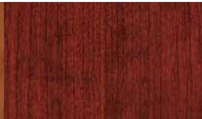
Light Cherry (veneer)