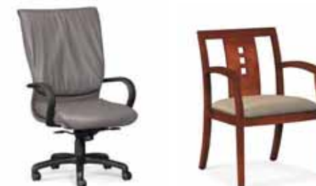
Posh Plus Executive Tilt Swivel, W429 with Davenport K93098 "Smoke" leather, Card 25-05 Fiesta Guest Chair, W312 with 6041 "Grid" upholstery, Card 24-03

If you enjoy sitting close to what you are working on, choose Merion models with the inside curve. The working-side edges curve in, letting you bring your chair closer to your papers or your computer.