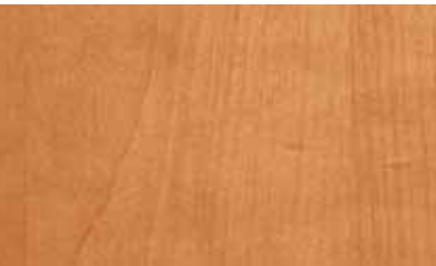
Honey Maple (veneer)