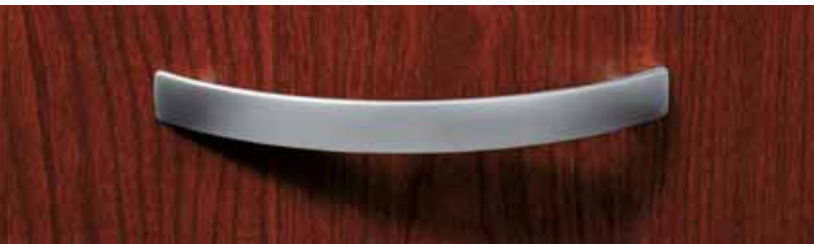
Matte Chrome Pull 53