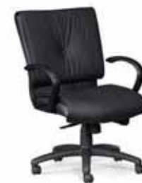
VIP Management Tilt Swivel with Loop Arms, V5033-5 in Black Leathermate only