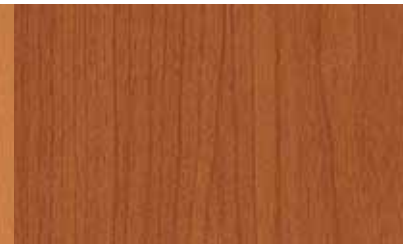
Golden Cherry (lamine)