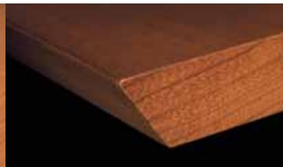
Reverse Bevel Edge