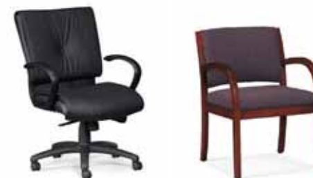
VIP Management Tilt Swivel with Loop Arms, V5033-5 in Black Leathermate only Unison multiple seating arrangement with Era F13648 "Concord" upholstery, Card 26-05

Merion is about choices, providing you with many ways to create an office that's an expression of you and your ambitions. Linear edges may best serve your work style, especially where it concerns the shortest distance between two points.