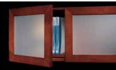
Frosted Glass Doors with Wood Frames