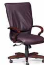
Escada Executive Tilt Swivel, W245 with Davenport K93048 "Eggplant" leather, Card 25-05