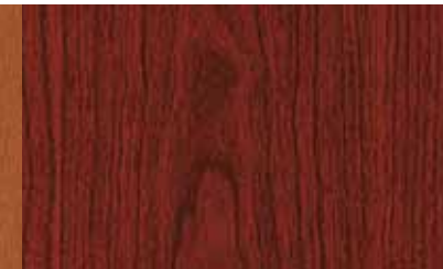
Light Cherry (lamine)