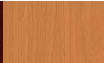
Honey Maple (lamine)