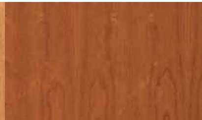
Golden Cherry (veneer)