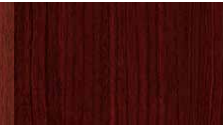
Cordovan Cherry (lamine)