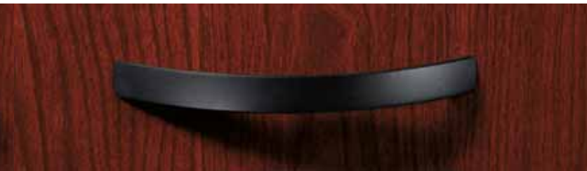
Matte Black Pull 63