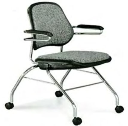
Y962 4C6 01E