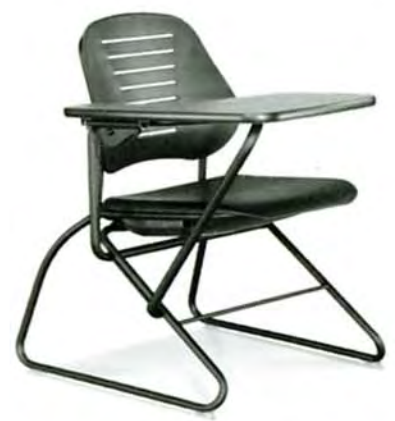
X959 73R 7E